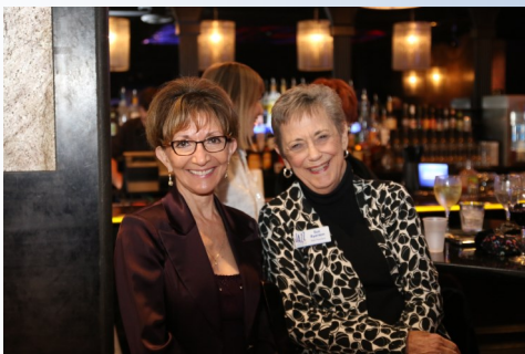
Boss Lady and Former Boss Lady