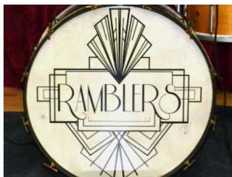
The Ramblers & Dixielanders

Beautiful simply does not describe the incomparable force known to the world as Patti LaBelle. As time continues to evolve, the soulful songbird's name has become synonymous with grace, style, elegance and class. Belting out classic rhythm and blues renditions, pop standards and spiritual sonnets have created the unique platform of versatility that Ms. Patti is known and revered for.