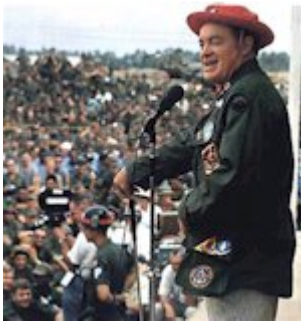
Bob Hope 1903 - 2003

Wednesday, November 11th Remember those who served.