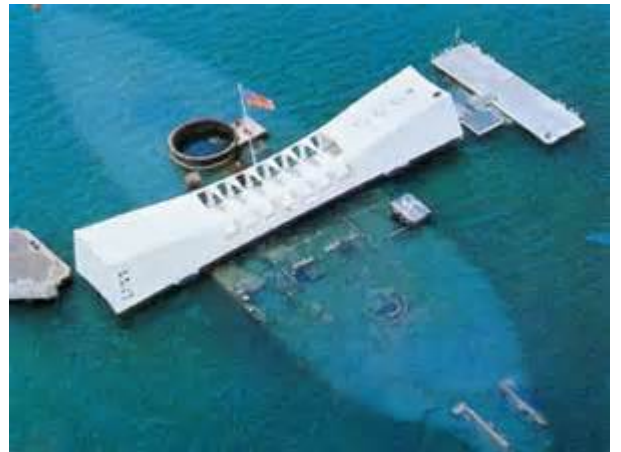
Memorial above the remains of the USS Arizona